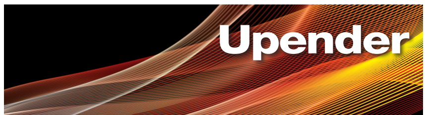
109 ton capacity mechanical upender