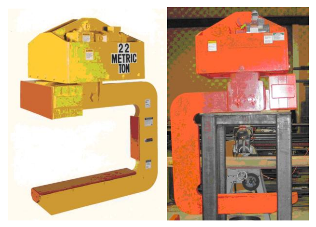
Motorized rotating C-hook sitting in its stand

Avon Engineering's Motorized Rotating C-hook comes equipped with a motorized rotator capable of continuous 360° rotation. This feature provides additional capability for safe and proper positioning of coils.