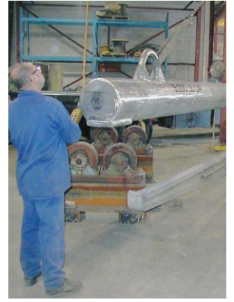
This C-hook was designed for submerging wire or rod coils in an acid pickling line. It is clad in 100% nickel to protect the steel used in the fabrication of the units.