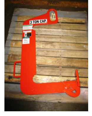
The C-hook above was engineered to move small palletized slit coils (mults) from eyehorizontal to eye-vertical position. It is made of high strength steel with inside corners polished and NDT inspected and is available in capacities from 500 to 10,000 pounds.